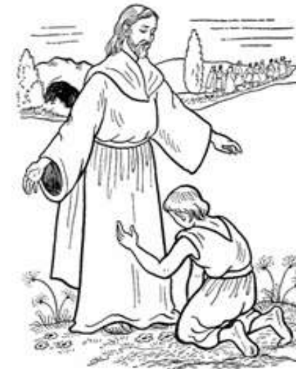
In a village near Jerusalem, Jesus saw ten lepers. He cured them, but only one remembered to thank Him.

Vigil of Sunday – 4:00 p.m. and 5:15 p.m. - Sunday – 8:00 a.m.(Polish) and 9:30 a.m.