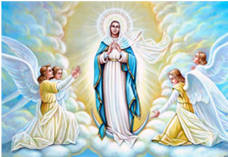
ASSUMPTION OF THE BLESSED VIRGIN MARY

Vigil of Sunday – 4:00 p.m. and 5:15 p.m. - Sunday – 8:00 a.m.(Polish) and 9:30 a.m.