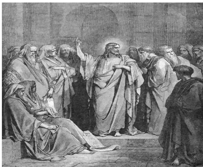
...Jesus at the synagogue on the Sabbath day

Vigil of Sunday – 4:00 p.m. and 5:15 p.m. - Sunday – 8:00 a.m.(Polish) and 9:30 a.m.